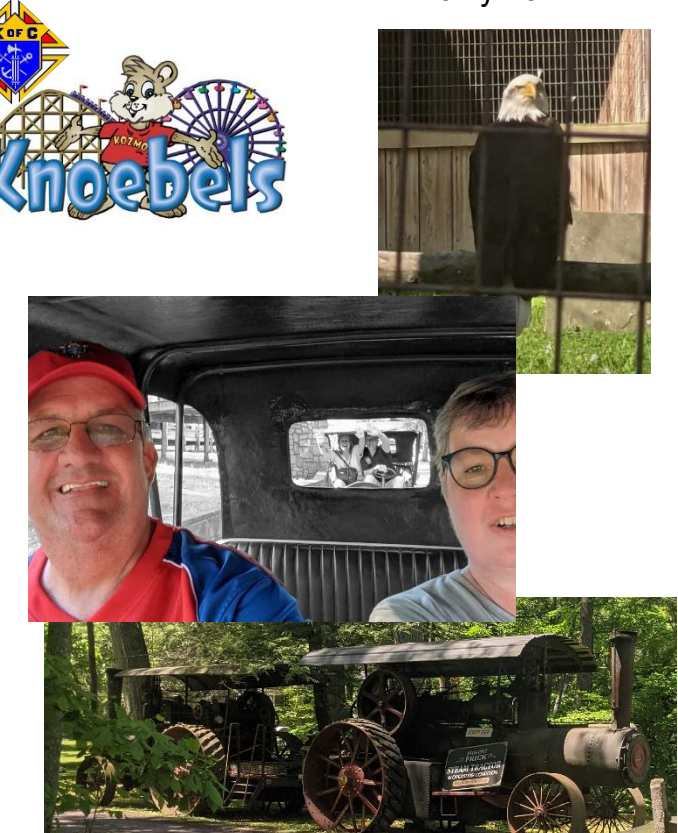
Thanks to everyone who came out! We want to make this an annual event with new ideas and suggestions! Please let us know!